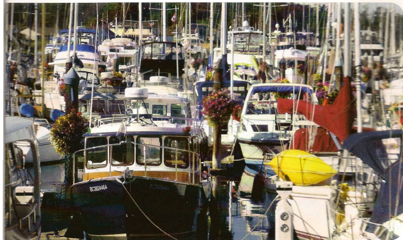
Sydney Harbour, Vancouver Island